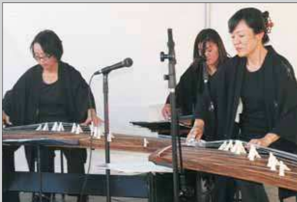
Oregon Koto Kai Ensemble