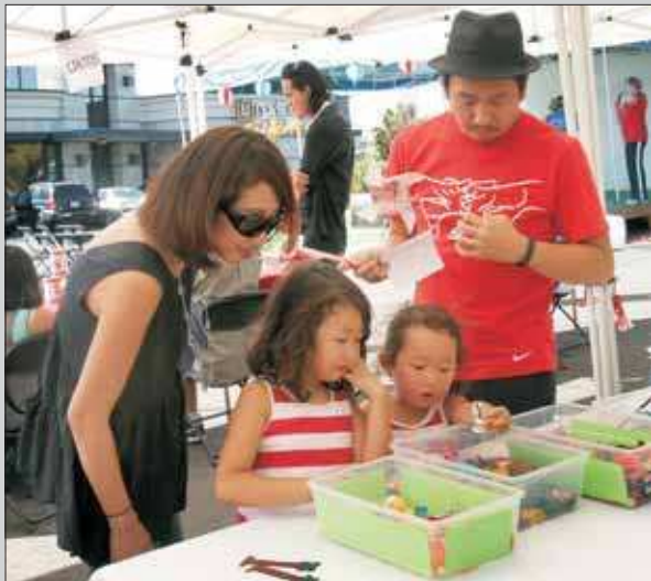
Games and prizes for children