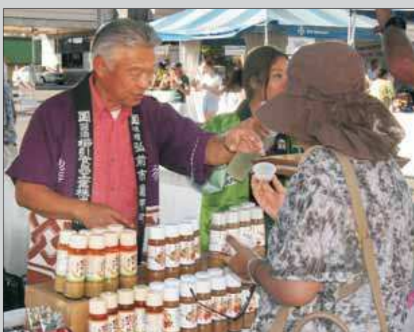
Vendors offering samples