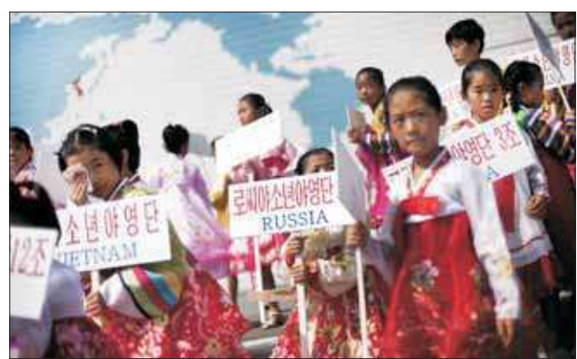
FOREIGNERS WELCOME. Young North Korean girls hold up signboards with the names of participating countries during an opening ceremony at the Songdowon International Children's Camp, in Wonsan, North Korea. The camp, which has been operating for nearly 30 years, was originally intended mainly to deepen relations with friendly countries in the Communist or non-aligned world. But officials say they are willing to accept youth from anywhere — even the United States.