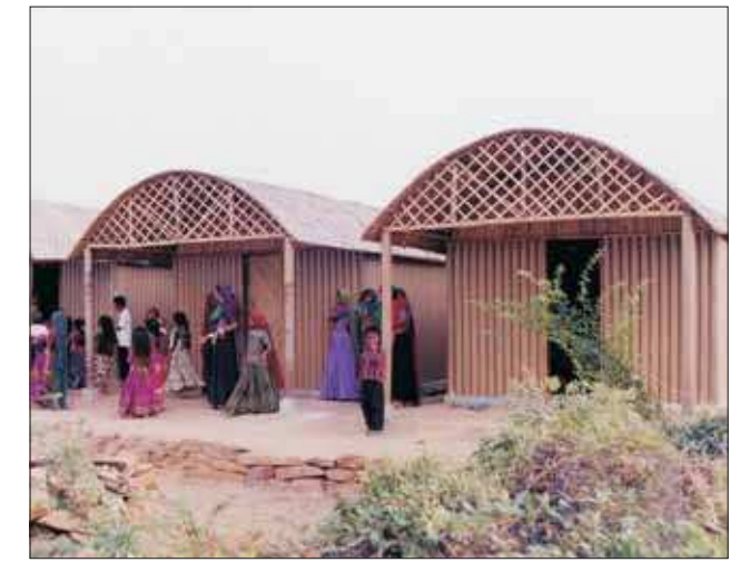
PAPER HOUSES. This 2001 image released by the Pritzker Prize shows a row of paper log houses in Bhuj, India designed by Tokyo-born architect Shigeru Ban, 56, the recipient of the 2014 Pritzker Architecture Prize.

similar satisfaction seeing people enjoy his most expensive designs or his simplest structures of paper.