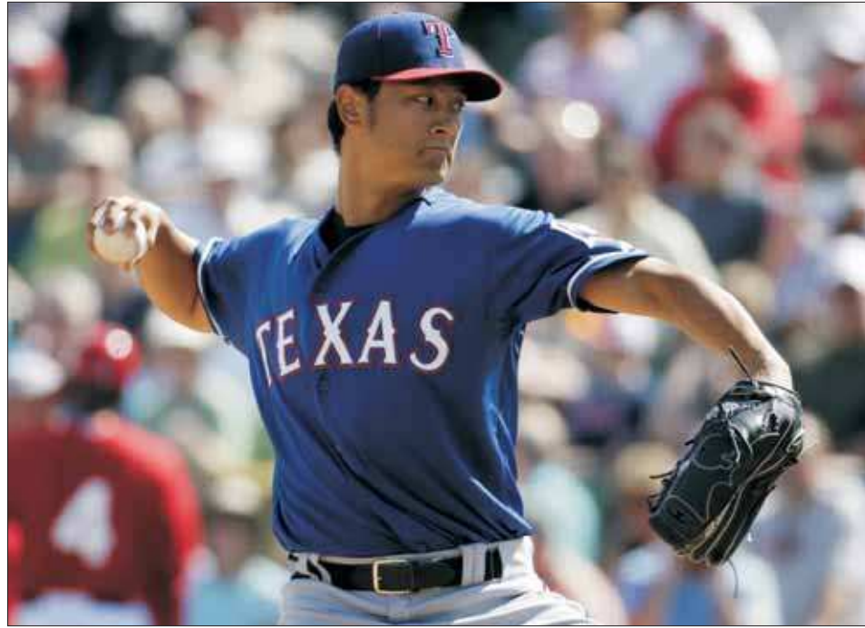
TRANSPACIFIC BASEBALL TRAFFIC. Yu Darvish of the Texas Rangers throws pitches during a spring training baseball game against the Los Angeles Angels in Tempe, Arizona. In two seasons, Darvish has amassed a 29-18 record with a 3.34 ERA.

Although his contract was very similar to Daisuke Matsuzaka's in both numbers