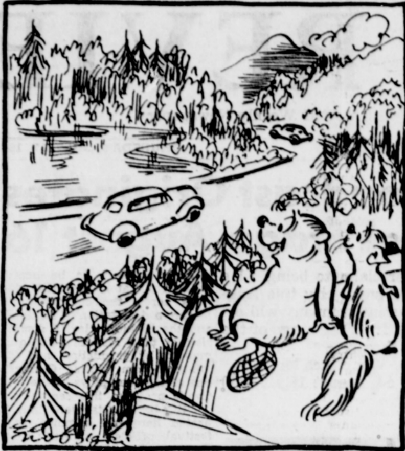
Forest Service, U. S. Department of Agriculture "The human race lives on trees—if trees didn't protect and maintain soil and water resources, there'd be no human race."