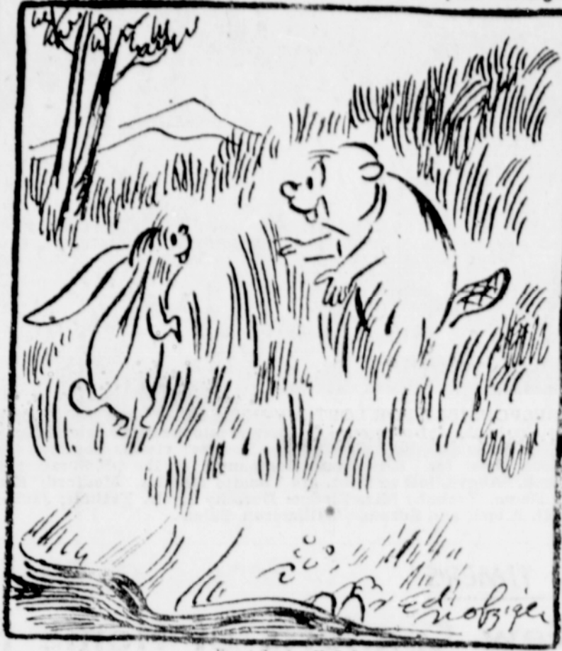
"Plant cover on the mountain determines whether the people in the valley will have clear water."

Two ways automobiles are most commonly finished: Lacquer and Liquor.