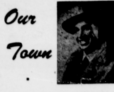
Our Town By HARRY NORDWICK

The only people that would suffer from such a universal move would be some cigar manufacturers and the hotel room service, while the PEOPLE would gain a clearer and firmer hold on the so-called democratic election process in our country.