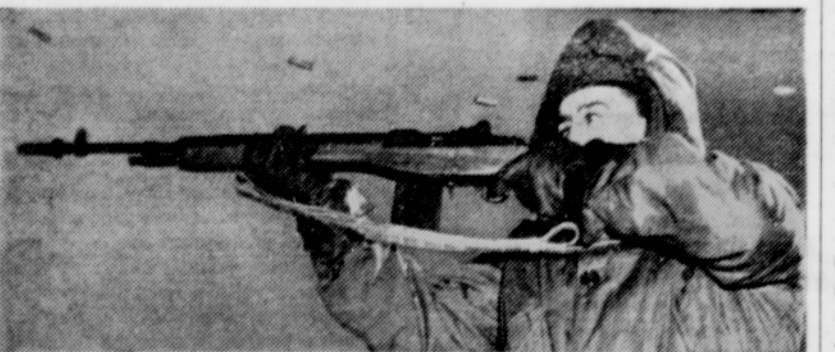
A new experimental lightweight caliber .30 rifle has been developed by Army Ordnance. Weighing about eight pounds, the new rifle is capable of selective semi or full automatic fire from its 20-round magazine.

If nothing else, these charges and countercharges are an indication that trouble is building up in other parts of Asia.