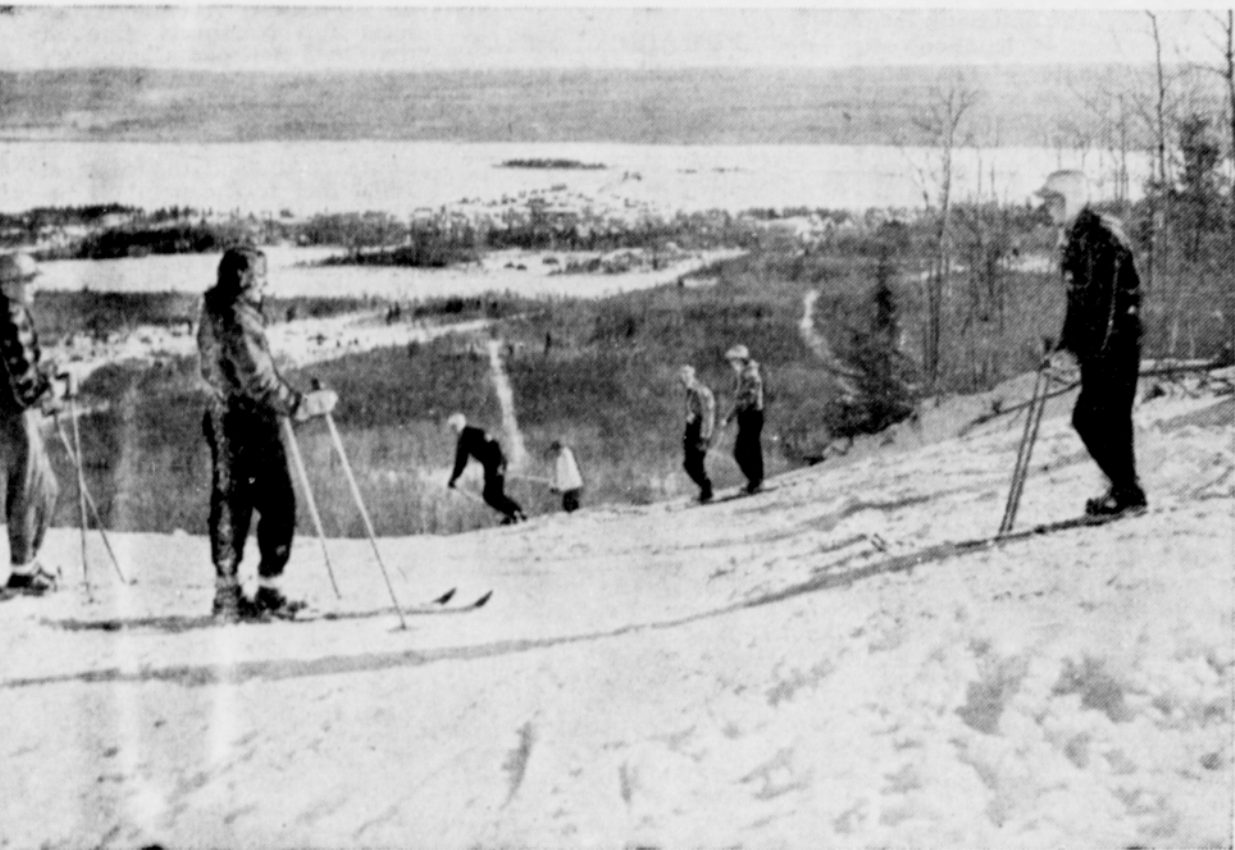
OLD SAWTOOTH HURLS CHALLENGE . . . This hill ascends back from Grand Marais, Minn., and rises to an elevation of 1,700 feet.