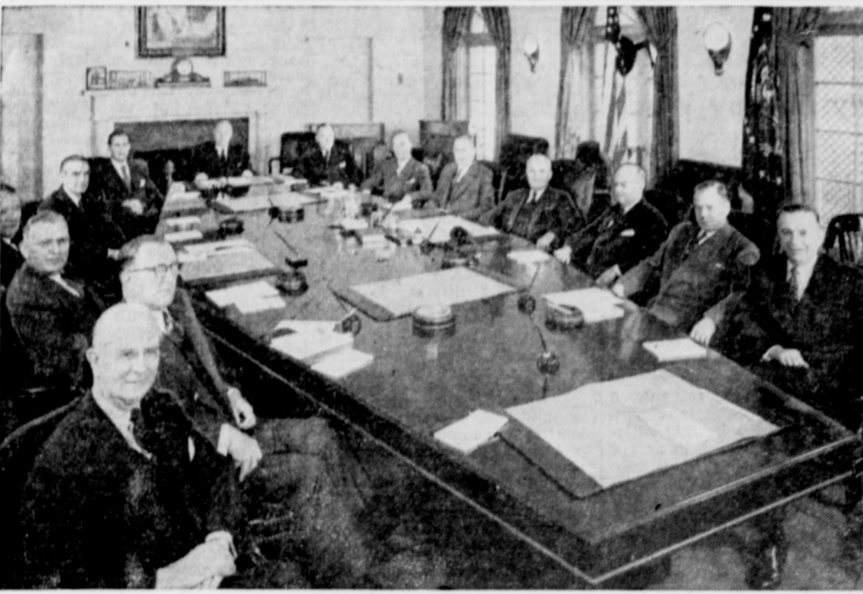
PRESIDENT AND CABINET . . . President Truman, members of cabinet and advisers pose for official portrait in the White House.