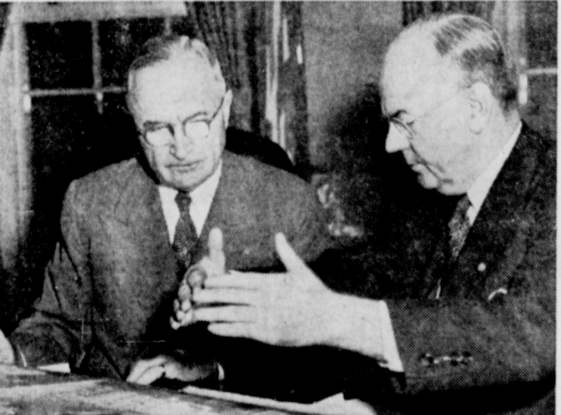
TO RE-ORGANIZE REVENUE BUREAU . . . President Truman, shown conferring with Treasury Secretary John Snyder, recently ordered "sweeping re-organization of the scandal-ridden internal revenue bureau."