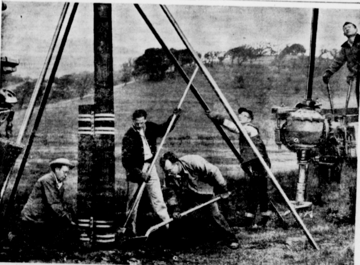
"Pole stubbers" at work: Inspection has revealed a pole which shows damage at the ground line. Now, reinforced with a short length, it will be strong as new, and we'll have saved much of the cost of a new pole.

DEPENDABLE INSURANCE COUNSELORS Corner Main and Oak Ashland Hotel Bldg. Phone 6781