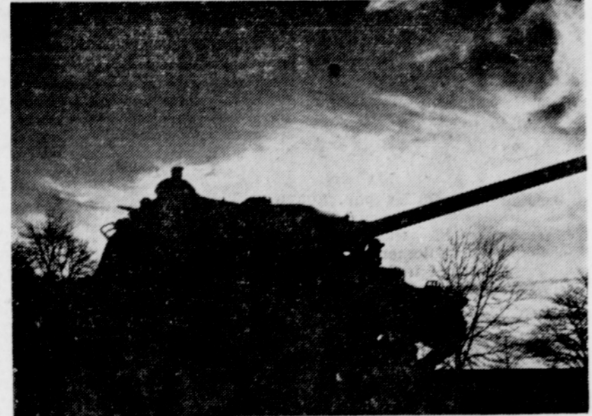
This is the first picture released of the nation's newest tank, the giant T-36. Ordnance officials say it will outlug any land-fighting machine ever built, although they will not reveal any statistics. They even photographed it blacked out against the setting sun to safeguard military security.