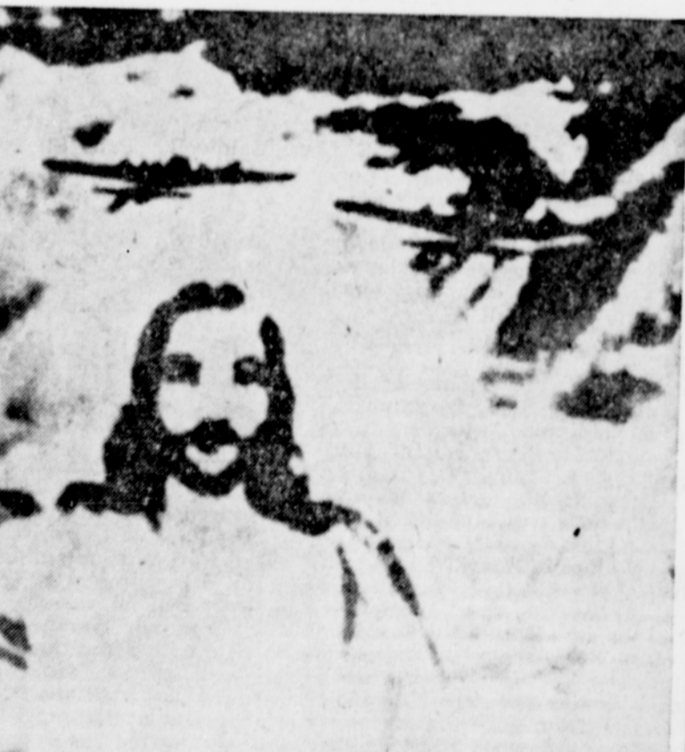
UNUSUAL PHOTO... This picture, which appeared in the Ashland (Ky.) Independent, was represented to the newspaper as an actual photograph taken in sky over Korea. A Chicago man was taking a photo of an American and Red plane in a fight. He sent the picture back to a relative in Chicago and a neighbor sent it to a brother in Ashland. Demand for the issue carrying the picture was so great it was sold out. The issue was repeated and it too was sold out.