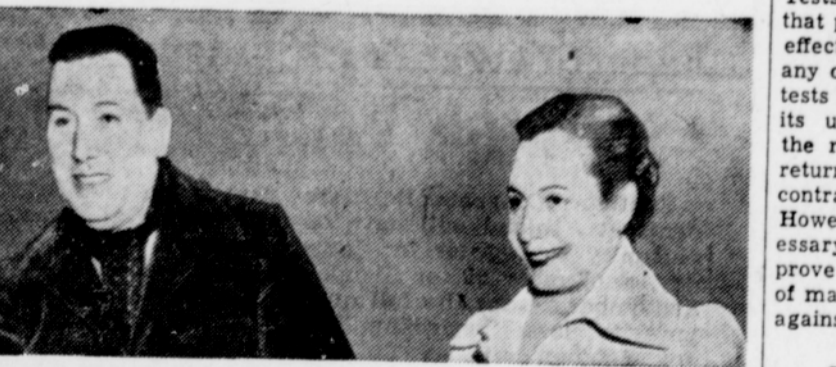
Eva Peron, wife of President Juan Peron of Argentina, often called the most powerful woman in the world, has been nominated to be her husband's running mate as Vice-President in the November 11 elections. The election is only a formality under Argentina's dictatorship. She would be the first woman in history to hold such a high office in the Americas.

From now until the conference closes, the people in the home towns of the country can expect a flood of Soviet propaganda against the treaty. In fact, one of the greatest propaganda slanders the world has ever seen is about to begin.