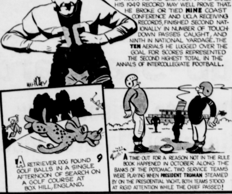
BRILLIANT U.C.L.A. END IS RATED BY MANY AS THE GREATEST IN THE LAND. HIS 1949 RECORD MAY WELL PROVE THAT HE BROKE OR TIED NINE COAST CONFERENCE AND UCLA RECEIVING RECORDS, FINISHED SECOND NATIONALLY IN NUMBER OF TOUCH-DOWN PASSES, CAUGHT AND NINTH IN NATIONAL YARDAGE, THE TEN AERIALS HE LUGGED OVER THE GOAL FOR SCORES REPRESENTED THE SECOND HIGHEST TOTAL IN THE ANNALS OF INTERCOLLEGIATE FOOTBALL.