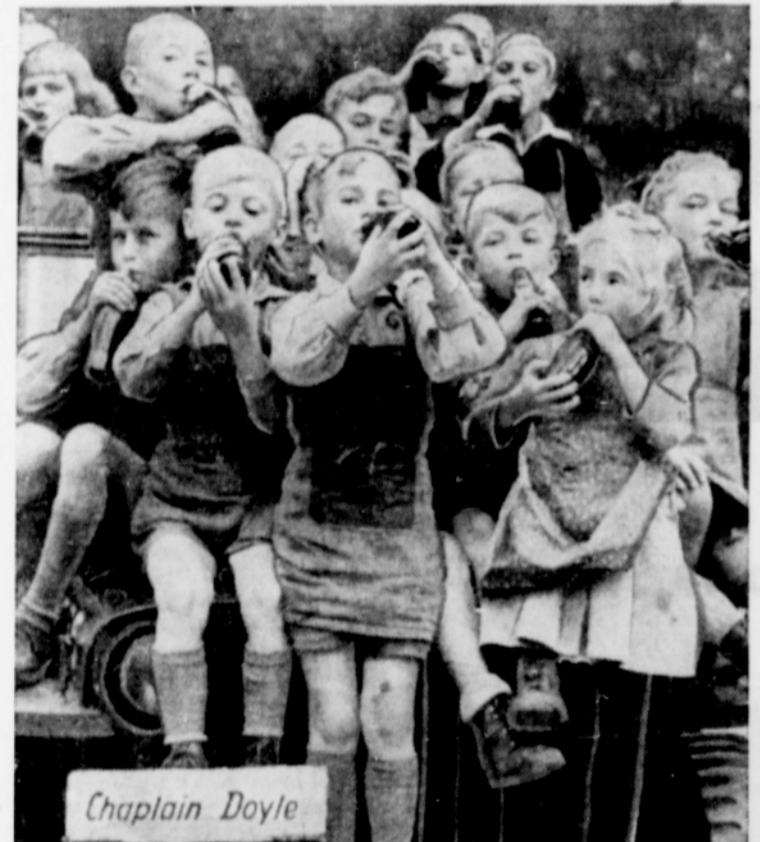
● The above picture is a familiar sight in Weiden. The chaplain's jeep, loaded with youngsters from the orphanage, as he takes them on an outing. German youngsters are the same as children anywhere, a bottle of pop and a jeep ride is a thrill and an adventure. And it is a wonderful treat to be invited to lunch with the chaplain.

FOR FAST RELIEF, rub in Ben-Gay. Contains up to 2 1/2 times more of those two famous pain-relieving agents, methyl salicylate and menthol, than five other widely offered rub-ins! Also for Pain due to RHEUMATISM, MUSCULAR ACHES, HEADACHES and STRAINS. Ask for Mild Ben-Gay for Children. Copyright 1949, by Thos. Loening & Co., Inc. QUICK! RUB IN Ben-Gay THE ORIGINAL BAUME ANALGESIQUE