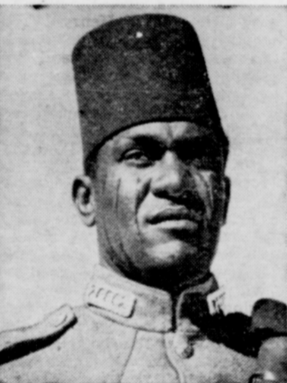
● Inspection (above) of a company of the Haganah is strict. The Corps, numbering more than 1,000 men and 2,000 white camels from the Egyptian Sudan, patrols Egypt's 3,000 mile border line. Two of Egypt's "Mounties" are pictured at left and right. The vertical cuts on their faces were carved there by their mothers when they were five years old. They are very proud of them, because they tell the men are from the lower Sudan.