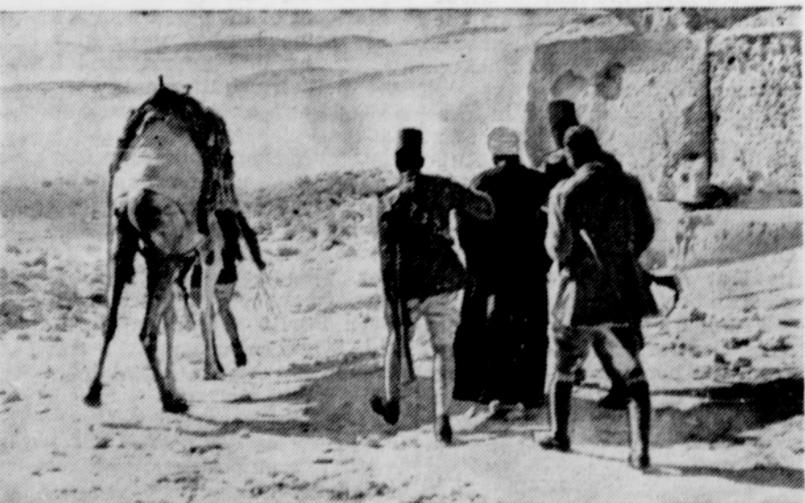
● With the training exercise finished, this is the way to escort a desert suspect, says the Haganah. A man on each side and one to follow. This is the end of the typical day for recruits, a lesson gained from experience. The most amazing faculty of the Corps is their ability to follow any given camel track, picking it out among hundreds of others