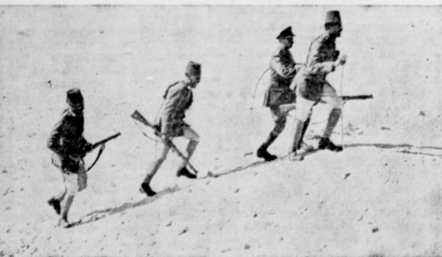
● With their commander, (left) the recruits follow the trail and trot up a hill near the pyramids. These men are trained to cross the toughest desert wastes with a four gallon supply of water that must last a minimum of five days. It often lasts ten. An average daily patrol covers 65 miles of Sahara sands.