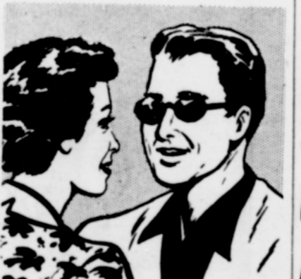
... her first thrilling love affair ...