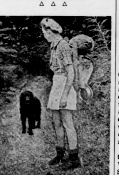
Hundreds of trails like the one above wind through our national forests. The picture above is of Pilchuck Trail in Mt. Baker National Forest in the state of Washington.

On the national forests there are many swimming areas, 70,000 miles of streams for fishing, and 100 million acres of good hunting country. There are 120,000 miles of forest highways and roads for the motorist or bicyclist.