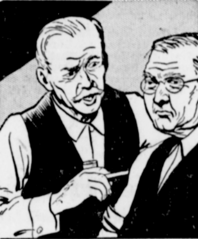
"How's that?" said Asa, regarding Si in astonishment. "Sell the town that rickety old windmill?"

The next day Si went down town and tackled other prominent citi-