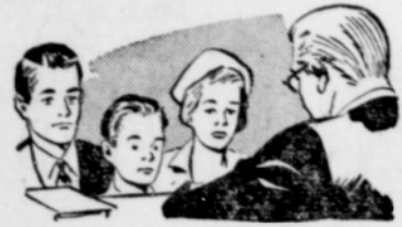
Do you "own" your children?

Answer: Yes, if he is very immature—or exceptionally mature. A man who is so childish emotionally that he prefers putting the responsibility for his life on his wife's shoulders, even at the cost of having nothing much to say about it, may be content to be known only as a famous or successful woman's husband; and so may a man so sure of the importance of his own work that he does not care if nobody else recognizes it. But the average male's insecure self-esteem demands that everyone shall realize that he "wears the trousers."