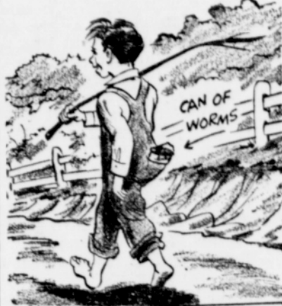
When fishing in mid-summer, take some live bait along.

As a case in point, take the problems of summer fishing. During this period of the year, the good fish—that is those which are of a size sufficient to thrill the angler and create envy among his friends—lie in the deeper pools during most of the daylight hours. It is true that they will come into the shallows to feed during the very early morning and late twilight hours, but it is of the other hours that this is written. During the hot hours of the day,