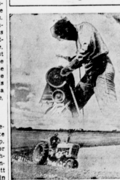
A new light—the electric arc—is appearing in farm shops, barns and garages from Maine to California. Farmers by the thousands are now saving themselves time and money by using arc welding to do their quick easy repairing and building of farm equipment.