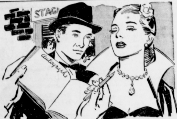
Can a man stand being "his wife's husband"?

Answer: Yes, if he is very immature—or exceptionally mature. A man who is so childish emotionally that he prefers putting the responsibility for his life on his wife's shoulders, even at the cost of having nothing much to say about it, may be content to be known only as a famous or successful woman's husband; and so may a man so sure of the importance of his own work that he does not care if nobody else recognizes it. But the average male's insecure self-esteem demands that everyone shall realize that he "wears the trousers."