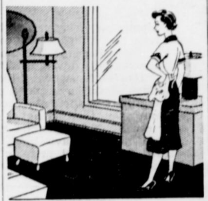
Choose floor covering to suit...

Rug choice is often hard to make because so many factors influence the decision. There's type of rug,