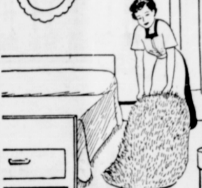
room and furniture styles

If walls and most of the upholstered pieces are plain, you would do well to choose some patterned rug for the room to avoid monotony.