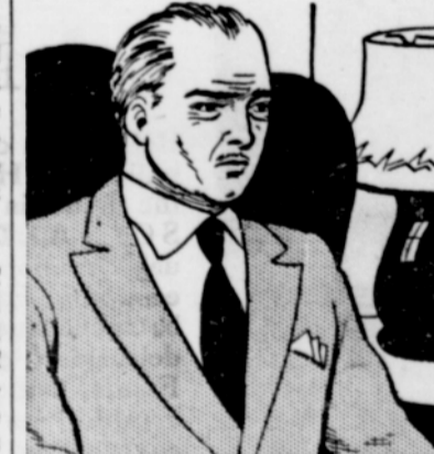
"... I wish I had..."

had cooked himself a dish of remorse on that afternoon 20 years earlier, and the taste of it was still in his mouth. Of course, he has forgotten it for hours at a time, but I doubt if a single day has gone by without the sting of that remembered hurt to the heart that loved him best in the world.