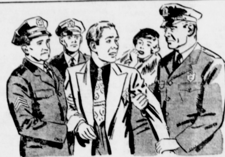
Does pleasure-seeking lead to crime?