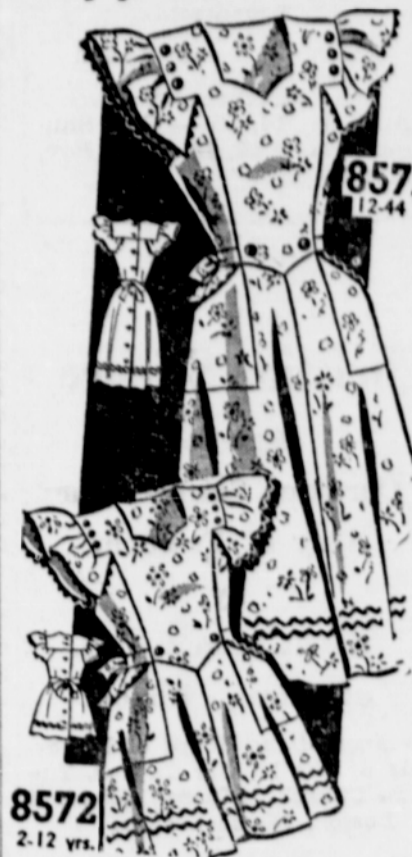
8572 2-12 yrs. Mother and Daughter A DORABLE, cool looking pinafore in the popular mother and daughter fashion. Each button down the back, has tiny shoulder ruffles and ample pockets. Trim with colorful ric rac.

Pattern No. 8571 is a sew-rite perforated pattern in sizes 12, 14, 16, 18, 20, 40, 42 and 44. Size 14, 4 1/4 yards of 39-inch.