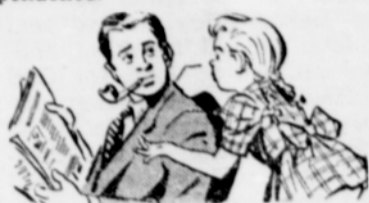
Should a parent be afraid to say, "I don't know"?

cause it saves time and trouble, but there's no fixed rule as to how rigidly he'll do so. The fact that a man has nerve enough to order raw steak if he likes it—or a plump woman will not wear a girdle—may show only exceptional independence.