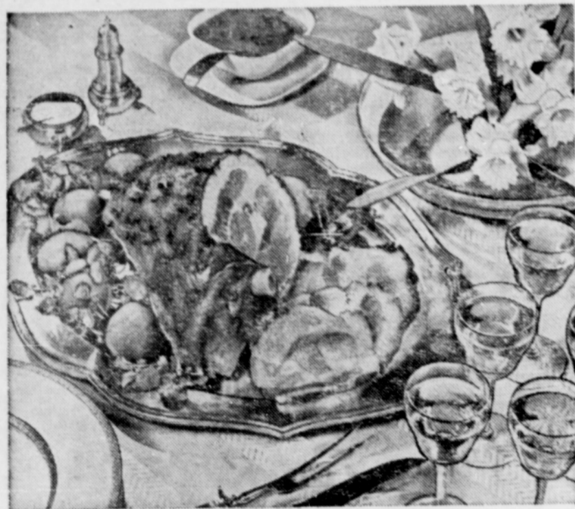
Serve Baked Ham for Special Dinners (See Recipes Below)