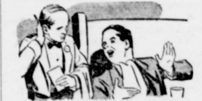
Are eccentric people "crazy"?

Answer: Certainly not always. Insane people may and do "act strangely," but so to a less degree do many men and women who are quite aware of what they're doing and have what they regard as good reasons for it. On the whole, a healthy-minded person will prefer to follow the conventions be-