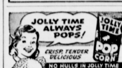
JOLLY TIME ALWAYS POPS! CRISP TENDER DELICIOUS NO HULLS IN JOLLY TIME