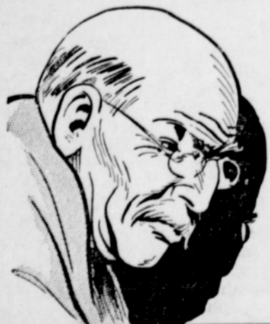
Obadiah was a mean old man... everybody hated him.

Oscar Jones, another neighbor, had come by while Moses was looking in the window.