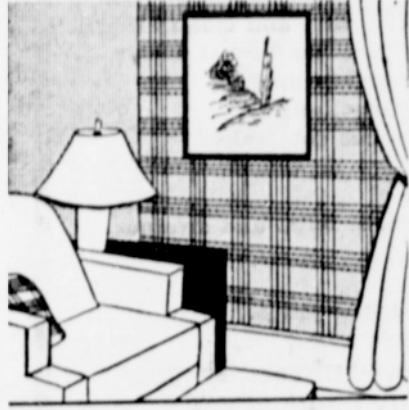
Solve living room problem...

fortable chairs, but when you think of the years of comfort they will give you, the time is of no importance.