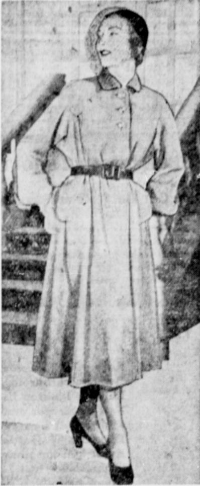
Important fashion trends are seen in this casual Spring coat of orange red thin wool tweed. Note the paired skirt pockets which appear to melt right into the coat as well as the deeply sleeved bodice fastened with gold buttons. The all-around belt is made of navy leather.