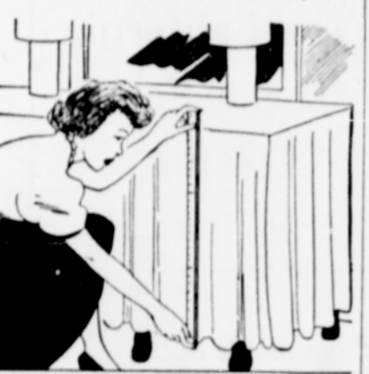
Measure your dressing table . . .

If you're planning to re-do the dressing table, make construction changes if they're necessary. Instead of having just a table top for jewelry boxes and cosmetics, investigate to see if you can't put a