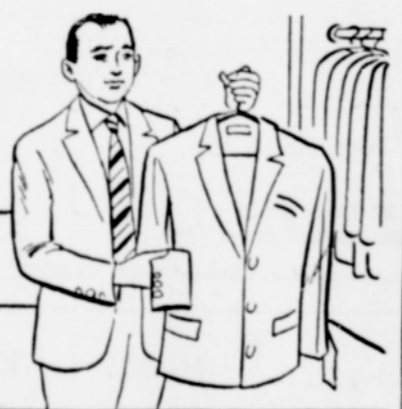
... selling men's suits . . .