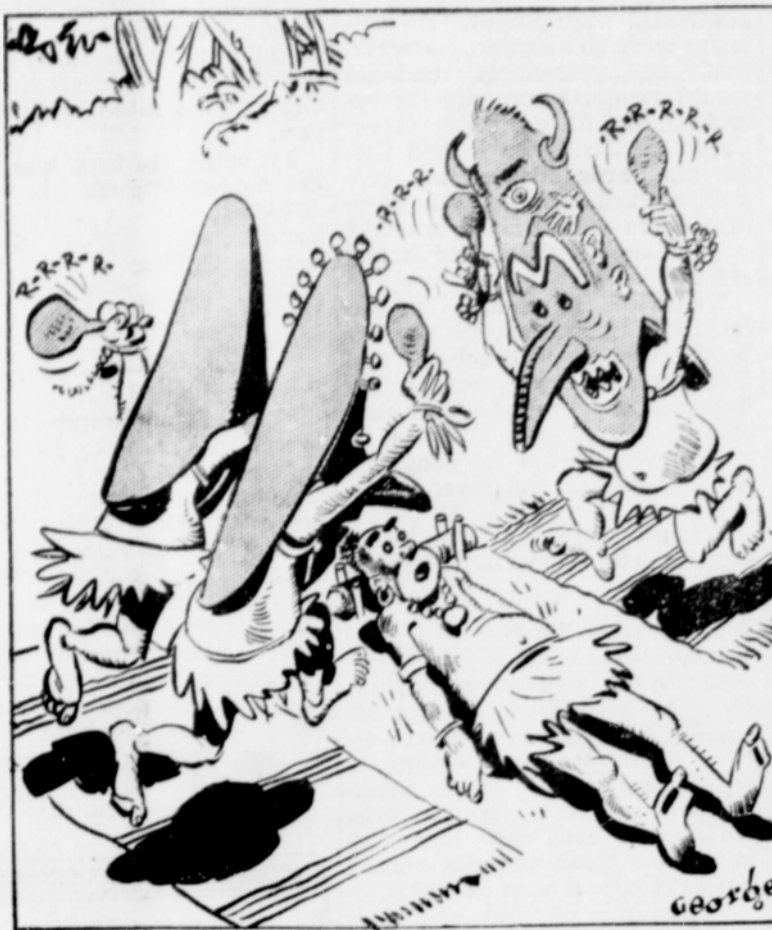
"But, Doc, all I asked for was something for my poison ivy."