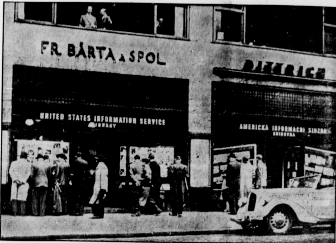
GETTING THE U. S. VIEW—Most Czechs in Prague ignore official propaganda from their own government and line up outside windows of the United States Information Service in the downtown section of the Czechoslovakian capital. A recent diplomatic storm was caused when the U. S. office displayed a portrait of Hungarian Cardinal Mindszenty which many flocked to see.