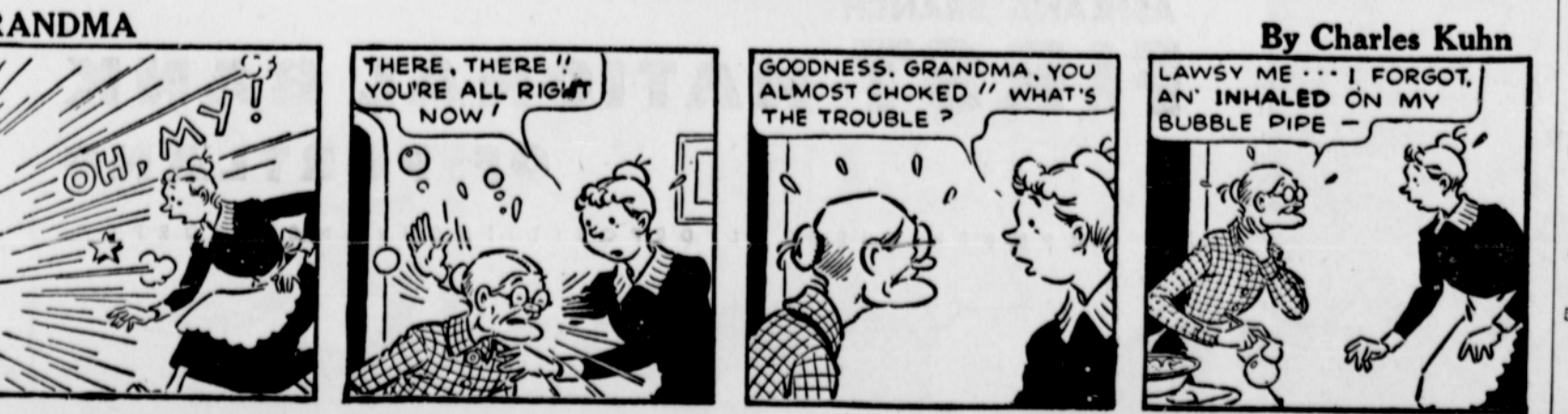
By Charles Kuhn