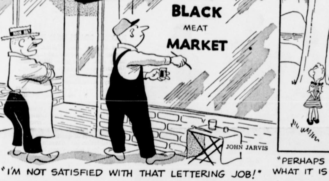
"I'M NOT SATISFIED WITH THAT LETTERING JOB!"