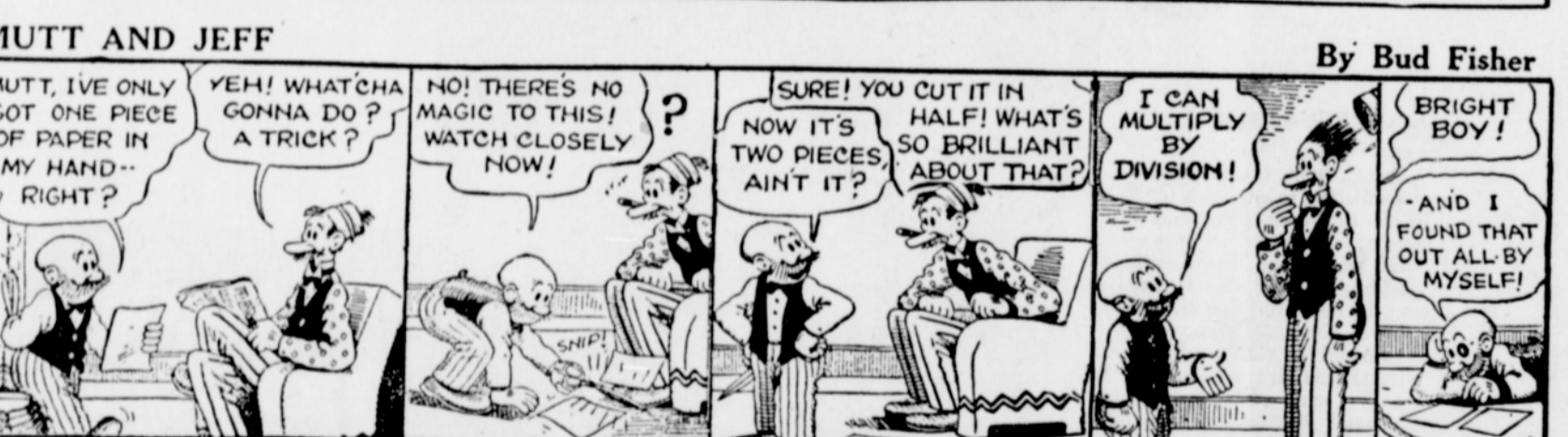
By Bud Fisher