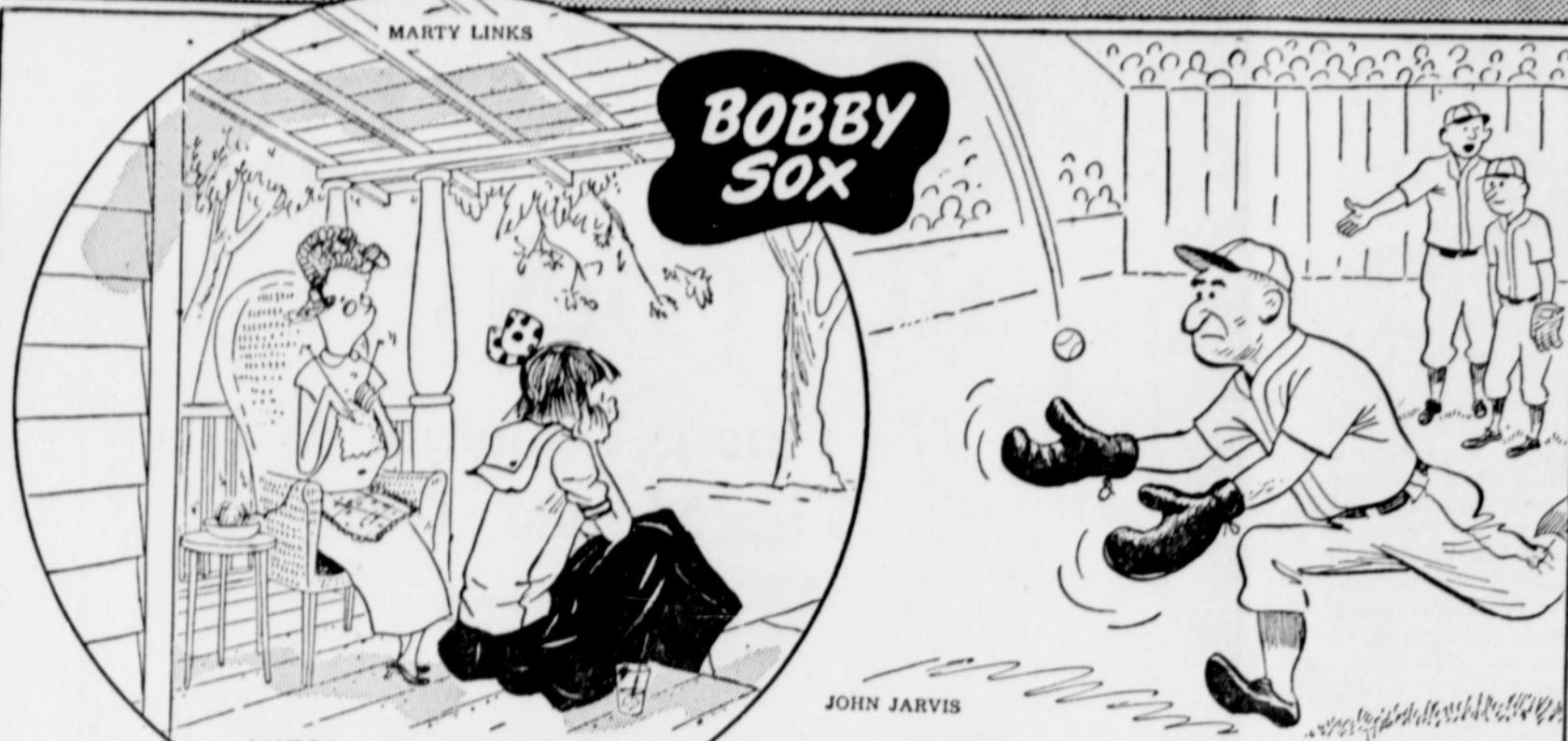
"HERE I SIT — WHILE LIFE PASSES ME BY."