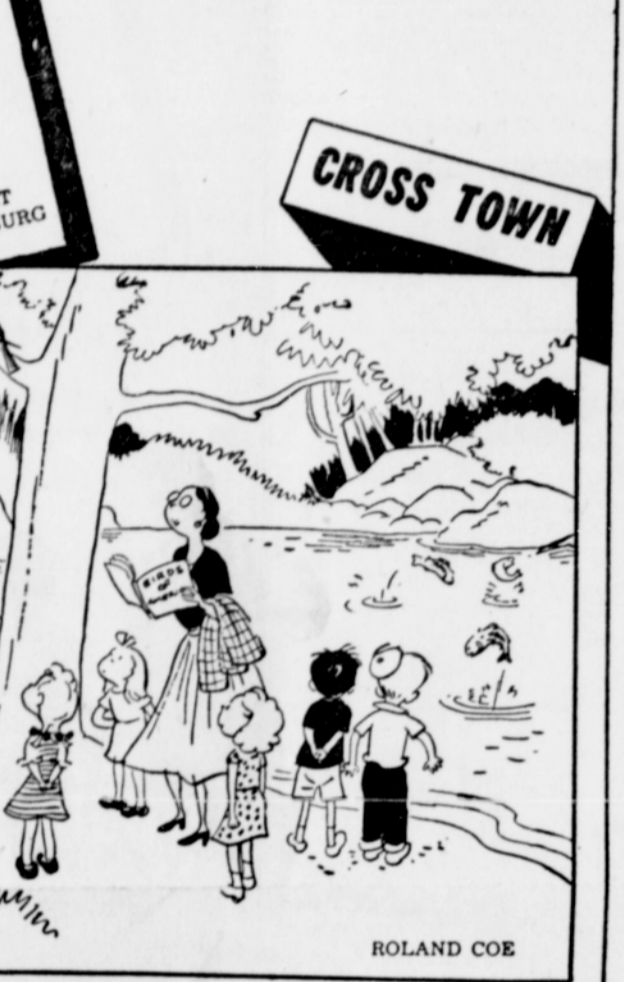
"PERHAPS THE BOYS CAN TELL US WHAT IT IS WE'VE DISCOVERED HERE."