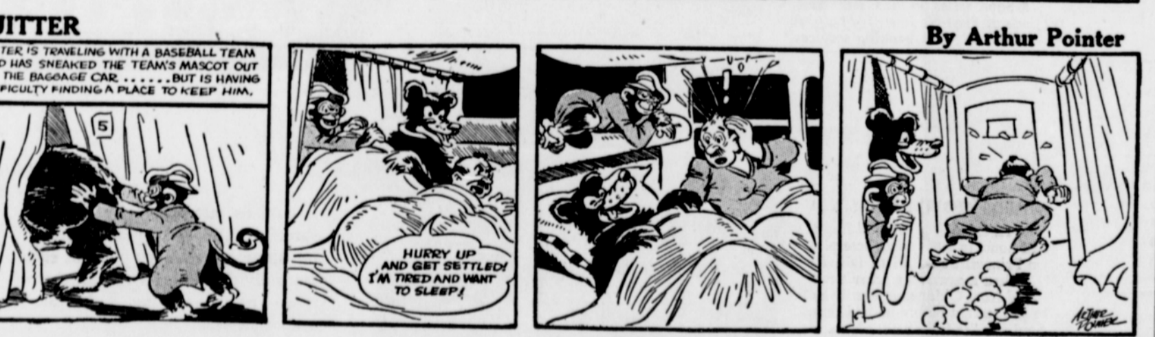
By Arthur Pointer