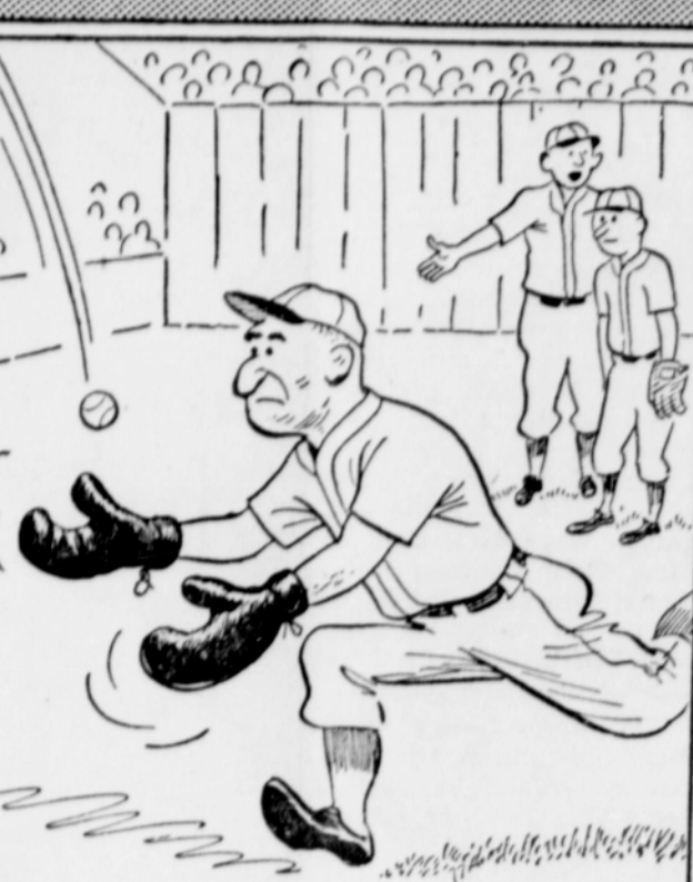
"BASEBALL REALLY ISN'T HIS CUP OF TEA."