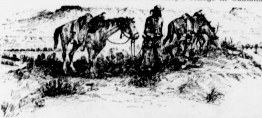
Men With Horses—DeMille