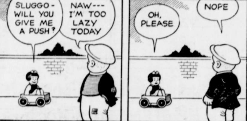
By Ernie Bushmiller