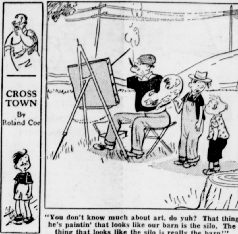
CROSS TOWN By Roland Coe

"Adele's the center of every conversation ever since she's been psychoanalyzed!"