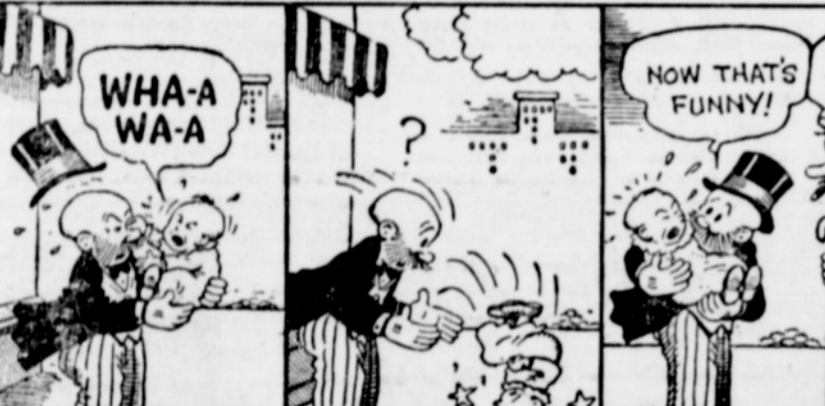
By Bud Fisher