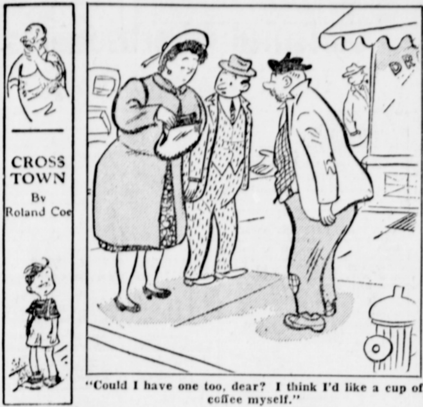
CROSS TOWN By Roland Coe