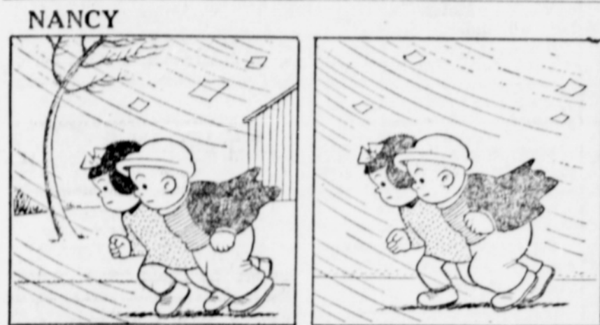
NANCY By Ernie Bushmiller