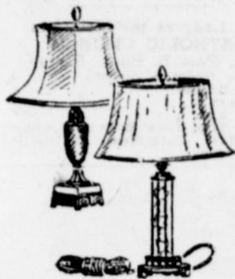
Fashionable mirror pedestal lamp with parchment shade and fabric exterior pattern

FOR CHRISTMAS SHOPPERS WEITZEL'S GIFTS OF DISTINCTION