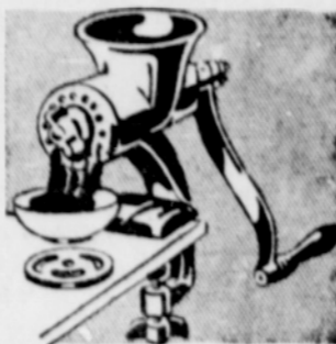
Handy Food Grinder

Absolutely everything in the line of kitchen utensils to make your cooking a pleasure