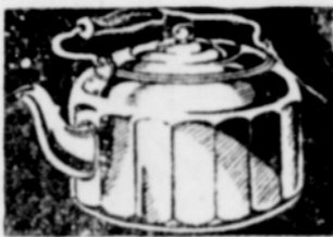
Handsome Gray Enamel Teakettles 98c

Both oval and square Oval $1.65 Square $2.49