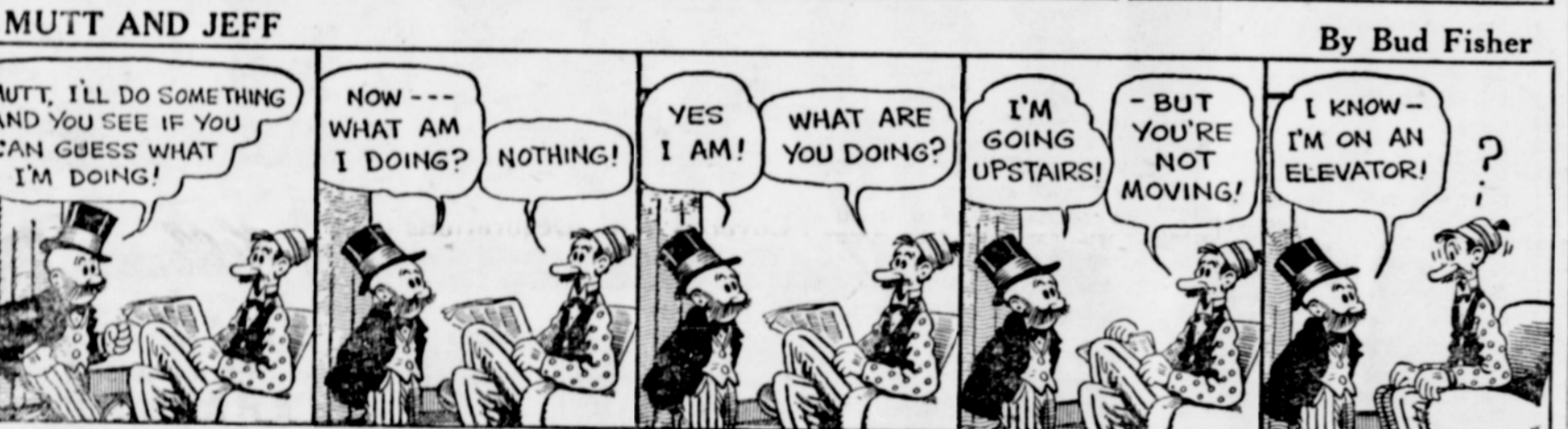
MUTT AND JEFF

GOSH THERE MUST BE AN EASIER WAY... WHAT'S COOKING MOM... SPAGHETTI? YES DEAR... HELP YOURSELF!!