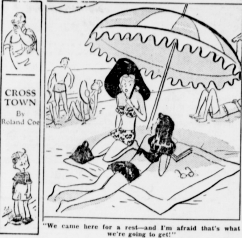
CROSS TOWN By Roland Coe

"We came here for a rest—and I'm afraid that's what we're going to get!"