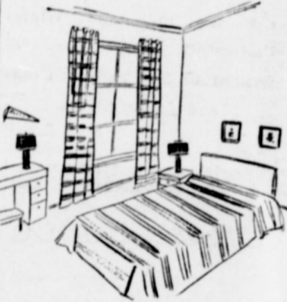
Let each room reflect...

If the room is warm, you should choose colors to cool it, such as