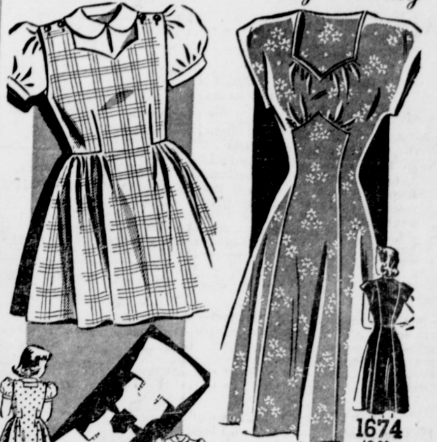
1678 4-12 yrs.