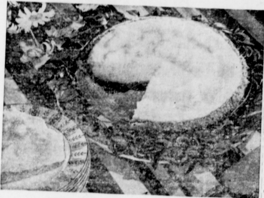
Pastry Makes a Delightful Dessert (See recipes below.)