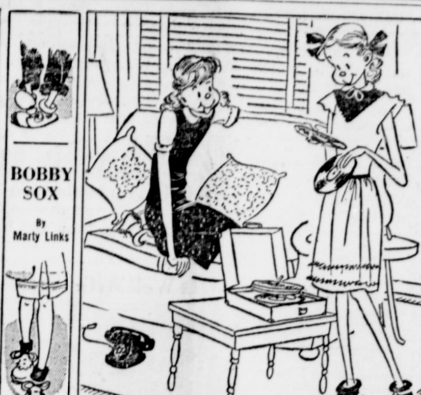
BOBBY SOX By Marly Links