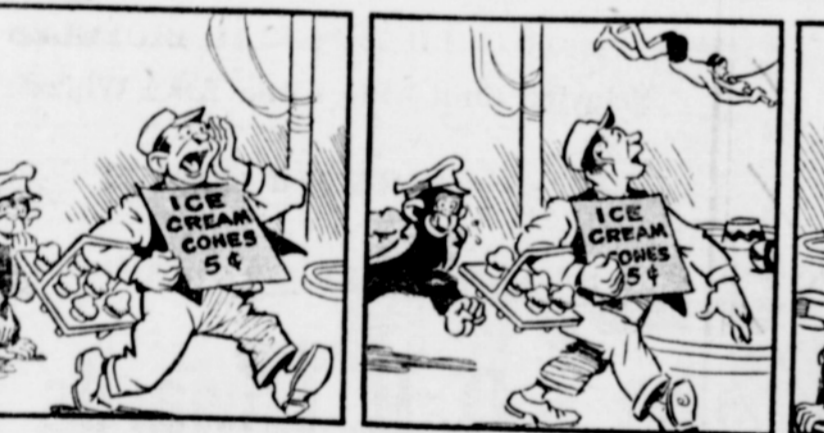
By Arthur Pointer