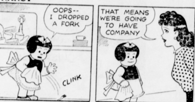
By Ernie Bushmiller