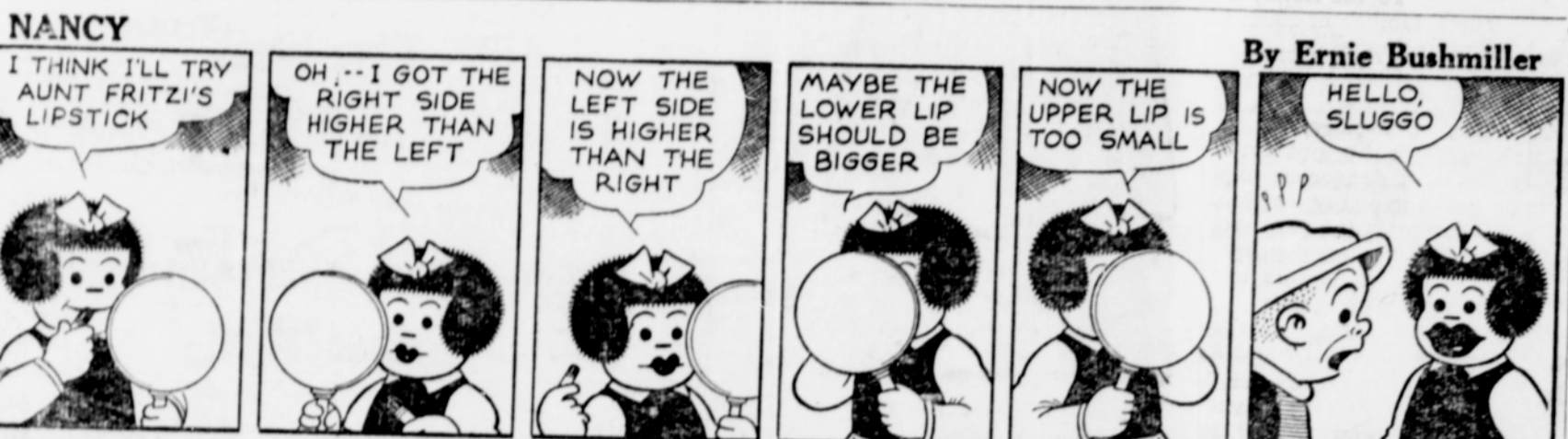
NANCY By Ernie Bushmiller

"The man who sold me this set of children's encyclopaedias said you could answer all your own questions. Here—go ahead and DO it."