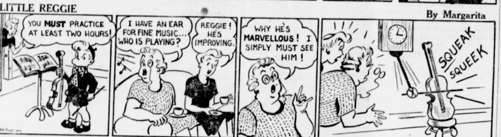
LITTLE REGGIE By Margarita

I THINK I'LL TRY AUNT FRITZ'S LIPSTICK OH--I GOT THE RIGHT SIDE HIGHER THAN THE LEFT NOW THE LEFT SIDE IS HIGHER THAN THE RIGHT MAYBE THE LOWER LIP SHOULD BE BIGGER NOW THE UPPER LIP IS TOO SMALL HELLO, SLUGGO