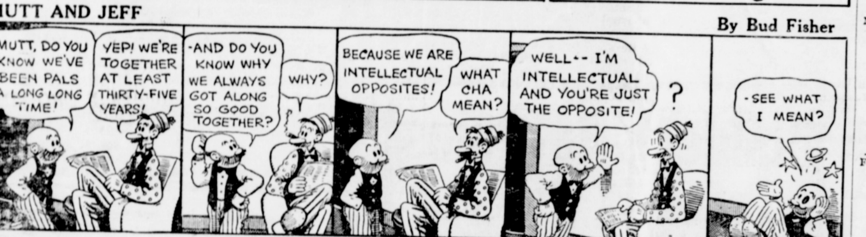
MUTT AND JEFF By Bud Fisher

YOU MUST PRACTICE AT LEAST TWO HOURS! I HAVE AN EAR FOR FINE MUSIC... WHO IS PLAYING? REGGIE! HE'S IMPROVING. WHY HE'S MARVELLOUS! I SIMPLY MUST SEE HIM! SQUEAK SQUEAK