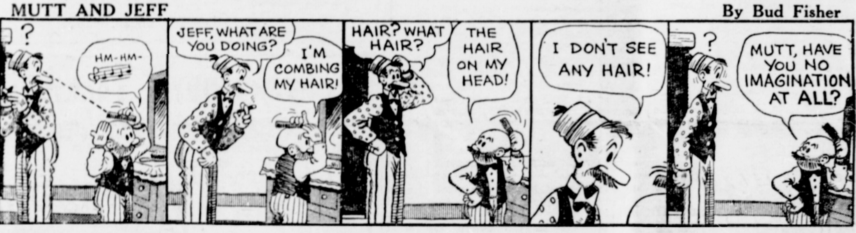
MUTT AND JEFF