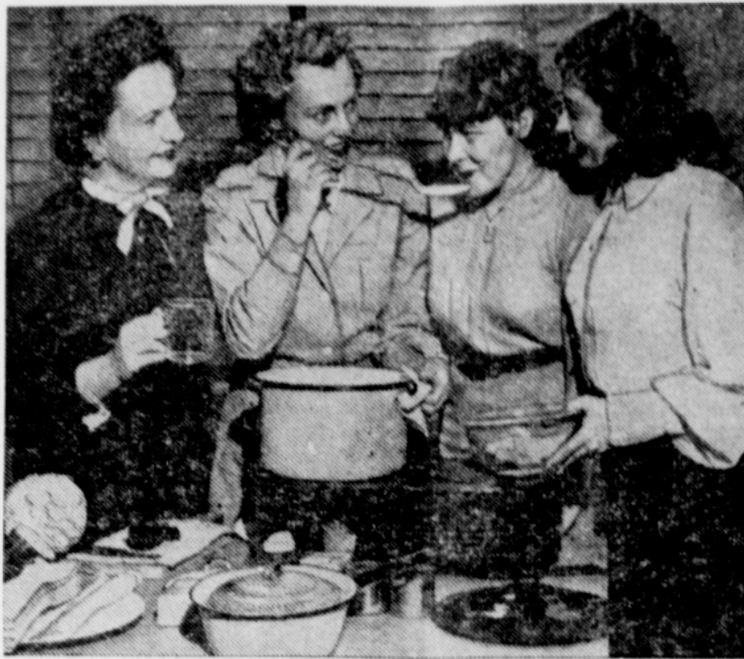
FOLLOW OLD ADAGE . . . Believing in the old adage about the way to a man's heart, 16 Chicago war brides are learning to cook "the American way" in a Red Cross nutrition class. Their No. 1 request is to learn to bake apple pie. War brides from Scotland, England and Egypt are shown above with a Red Cross instructor.