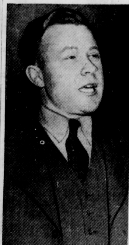
REUTHER ELECTED . . . Walter Reuther, former vice president of the United Automobile Workers of America, who was in charge of General Motors strike, defeated R. J. Thomas for the presidency of the union during a heated election. After election they both pledged united support to CIO.