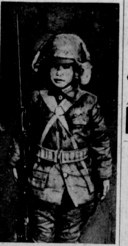
CHINESE VETERAN . . . This 12-year-old Chinese warrior, who belonged to the Chinese 6th army, has been credited with active participation in many of the roughest battles in which the Chinese forces took part.