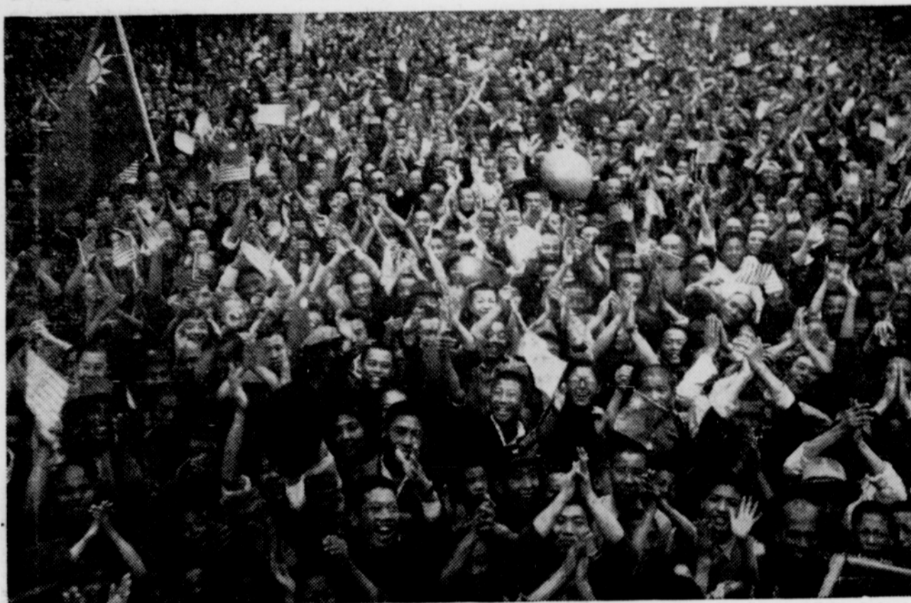
The usually phlegmatic Chinese let themselves go with wild enthusiasm to welcome the first contingent of U. S. marines that arrived in Tientsin, China, during the occupation of North China. The cheering crowd stood like this from dawn until the leathernecks arrived late at night. The leathernecks are well known by the Chinese, for during peacetime some U. S. marines were always on duty in that country.