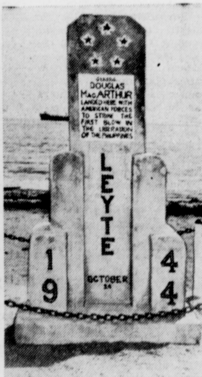
Monument erected on the "Red" beach near Tacloban, Leyte, P. I., marks the spot where General MacArthur stepped ashore to lead the fight which resulted in the successful liberation of the Philippines.