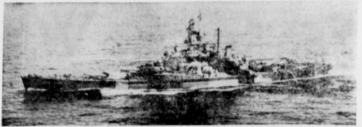
One of the first battleships to bombard the Japanese homeland, the USS INDIANA made the long trip from Tokyo Bay to San Francisco, where she dropped anchor in time to take part in the observance of Navy Day October 27. The record of the INDIANA includes engagements from New Guinea to Okinawa. The ship is one of the newest battleships of the fleet.