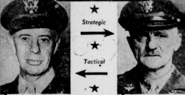
Gen. Geo. C. Kenney, Comdr., Far Eastern Air Forces