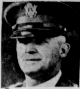
Gen. H. H. Arnold, Comdr., U. S. Army Air Forces