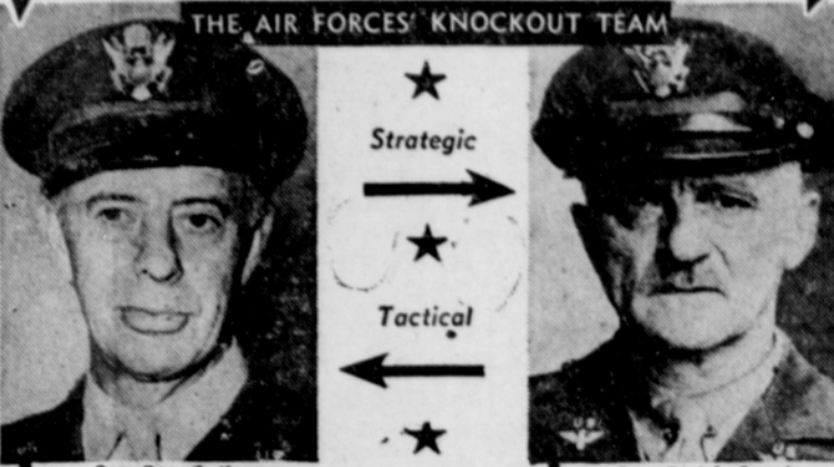
Gen. Geo. C. Kenney, Comdr., Far Eastern Air Forces