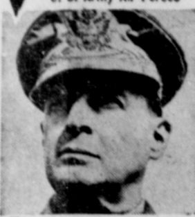
Gen. D. A. MacArthur, Comdr., All Army Forces in Pacific