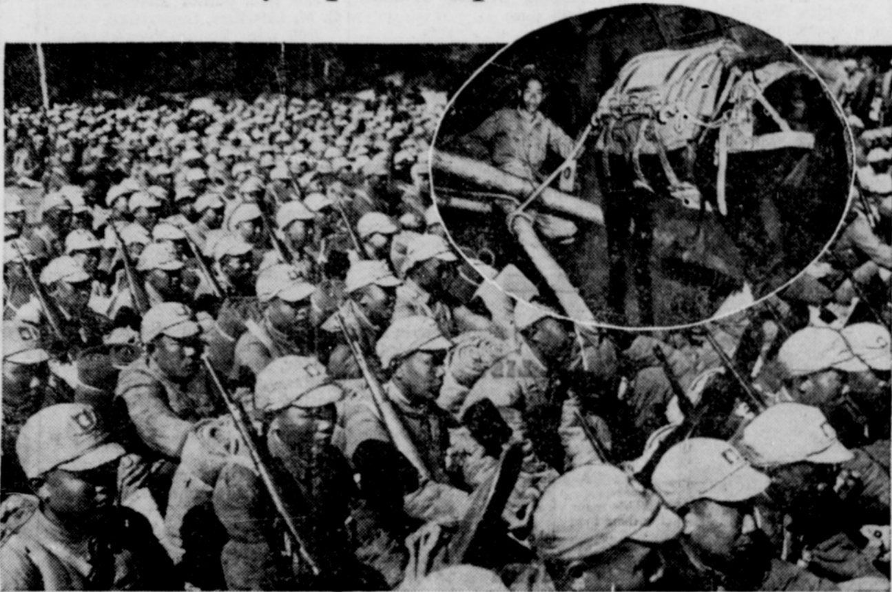
Lower photo shows one of the newly equipped and trained fighting units, as pep talk is given by Gen. Chen Ming Yun. Circle shows Chinese infantryman, veteran of the Burma campaign, prepare to board American air transports for flight over the "hump" to China. Using jungle bamboo to box off stalls inside a U. S. air transport, Chinese troops accompany their pack animals on a flight from Burma into China.