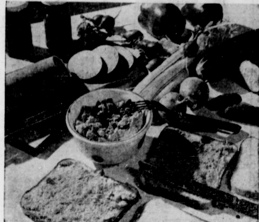
Sandwich Inspiration for Lunches