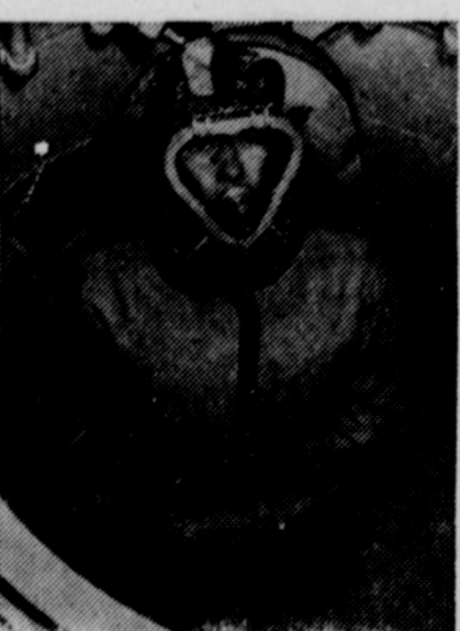
Jack Browne, 28 years old, is shown through the porthole of the decompression chamber as he was slowly released from the peak pressure to set record of 550 feet dive.