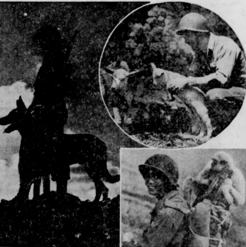
Dogs, goats or monkeys, regardless of nationality, the American expeditionary forces in the Pacific have tamed, adopted as pets and put to use to hunt out the Japs, locate poison gas, gun emplacements, or furnish milk to sick buddies. Thousands of rare and unusual pets will be brought into the United States when Tokyo falls.