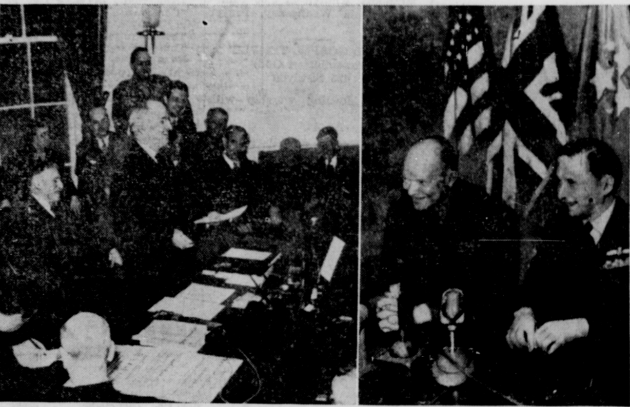
Left: President Harry S. Truman, officially ending the war in Europe. Gathered around him are members of his cabinet, family and officials. Right: Gen. Dwight D. Eisenhower, supreme Allied commander, makes announcement of German unconditional surrender at SHAEF, France. At left is Sir Arthur Tedder, deputy supreme commander. The world's greatest war was thus brought to a successful conclusion.