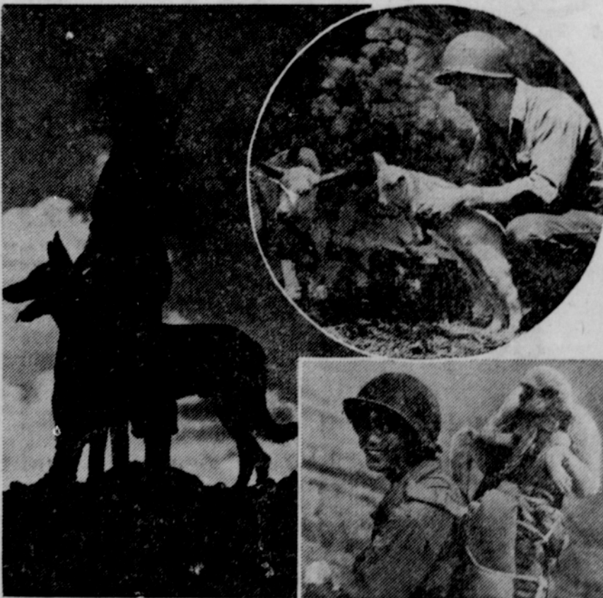
Dogs, goats or monkeys, regardless of nationality, the American expeditionary forces in the Pacific have tamed, adopted as pets and put to use to hunt out the Japs, locate poison gas, gun emplacements, or furnish milk to sick buddies. Thousands of rare and unusual pets will be brought into the United States when Tokyo falls.