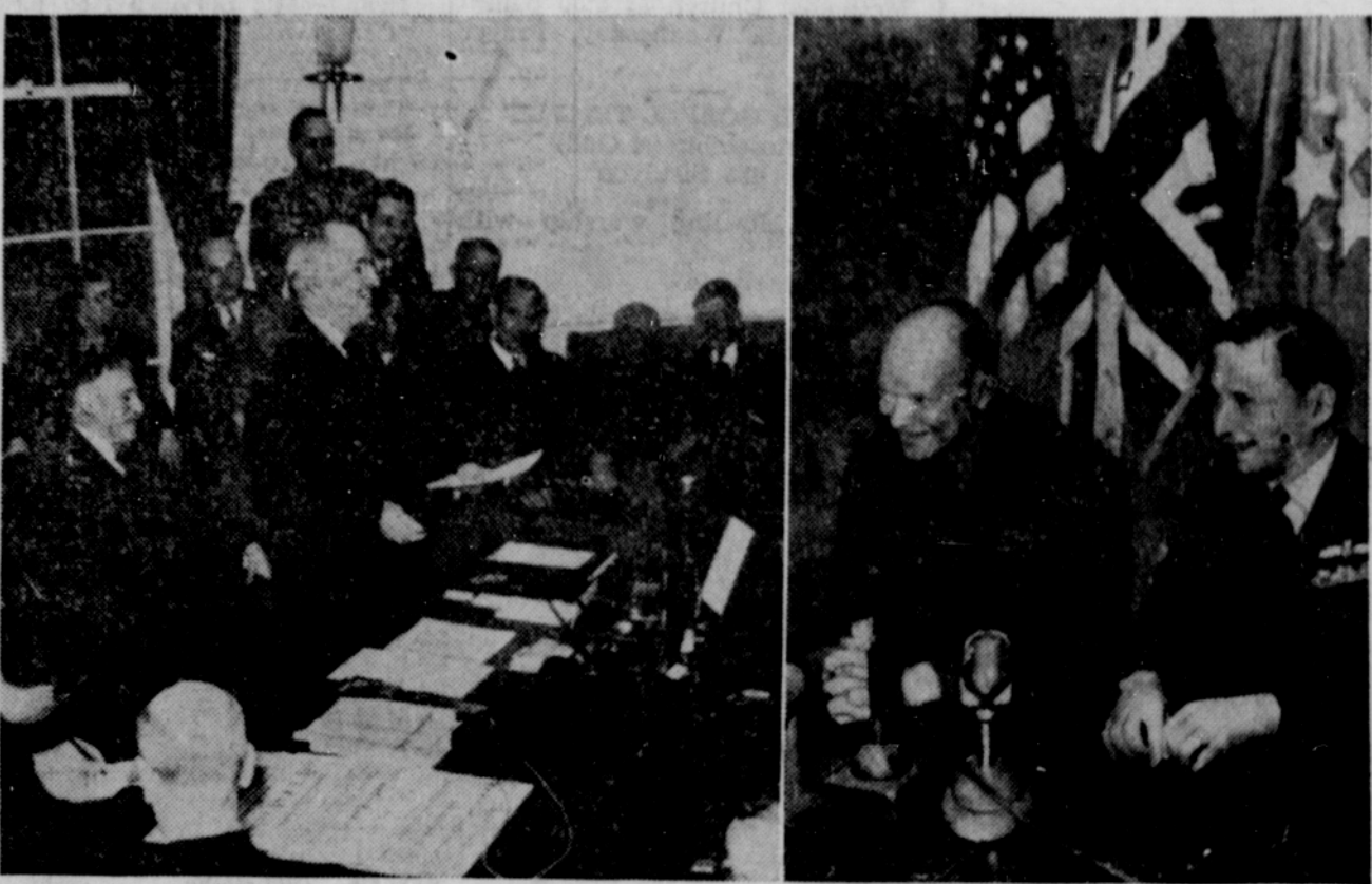
Left: President Harry S. Truman, officially ending the war in Europe. Gathered around him are members of his cabinet, family and officials. Right: Gen. Dwight D. Eisenhower, supreme Allied commander, makes announcement of German unconditional surrender at SHAEF, France. At left is Sir Arthur Tedder, deputy supreme commander. The world's greatest war was thus brought to a successful conclusion.