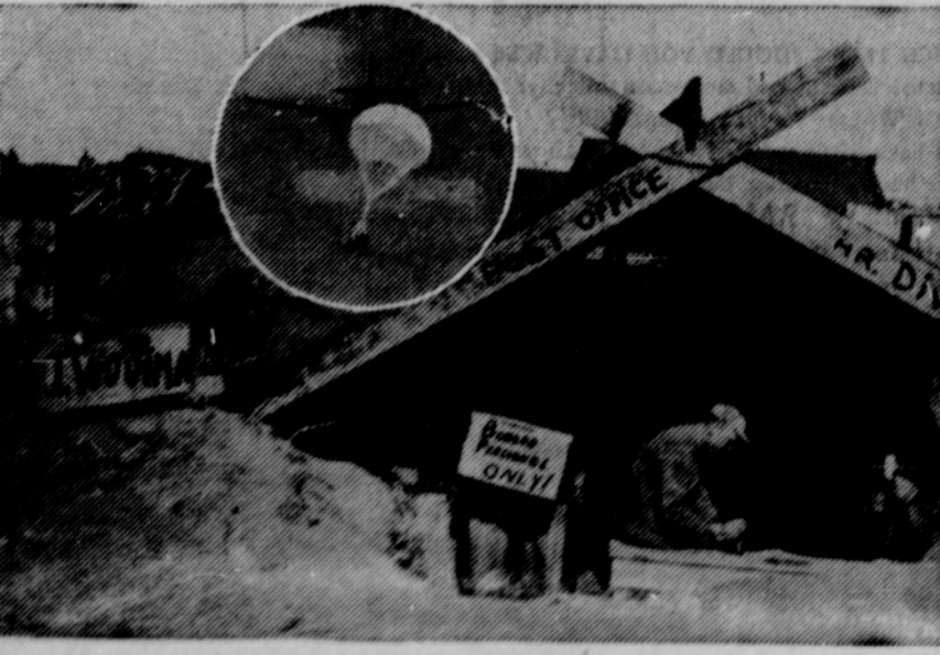
The accelerated educational schedule developed in the wartime emergency, which put the student through a normal four-year college course in from 28 to 36 months, will be discontinued as soon as possible by most colleges, but the government will see that substitute courses are furnished to G.I.s by airmail wherever desired. Returned soldiers may still secure training desired.