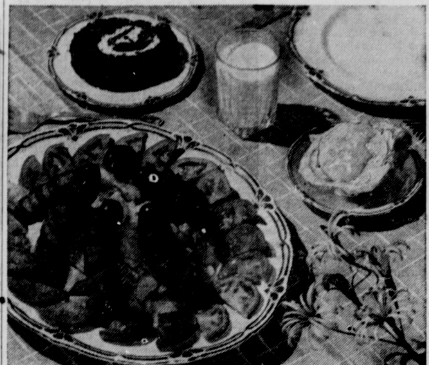
Simplicity Is the Keynote for Entertaining