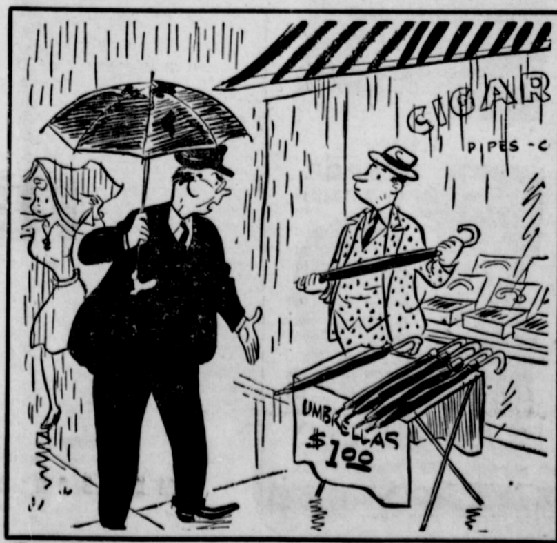
"Sure, there're holes in it. But I gotta carry it anyway—it be-longed to my wife's grandfather!"