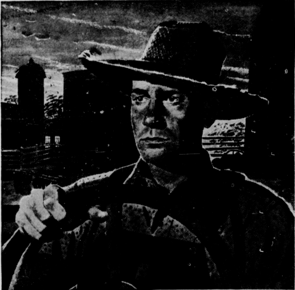
(Drawing courtesy Quaker State Oil Refining Corp.)