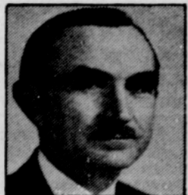
for U. S. Senator WAYNE L. MORSE