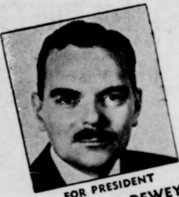
FOR PRESIDENT THOMAS E. DEWEY

This List OF REPUBLICAN CANDIDATES IS PUBLISHED FOR YOUR CONVENIENCE—SAVE FOR REFERENCE NOV. 7